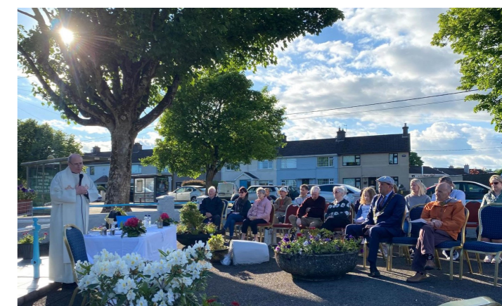
Parishioners at the recent Mass at Marian Park Grotto